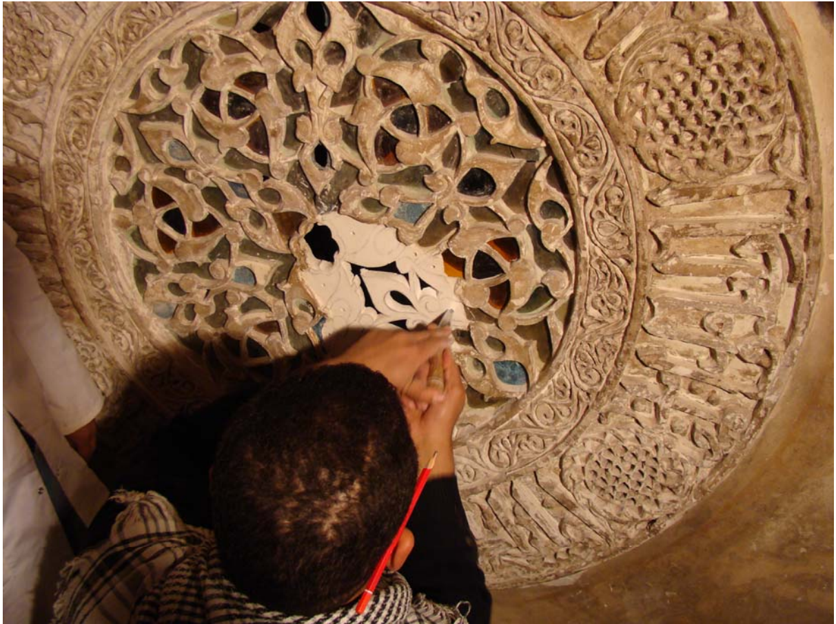
Completing the missing (and lost) parts of the stucco decoration in the west iwan