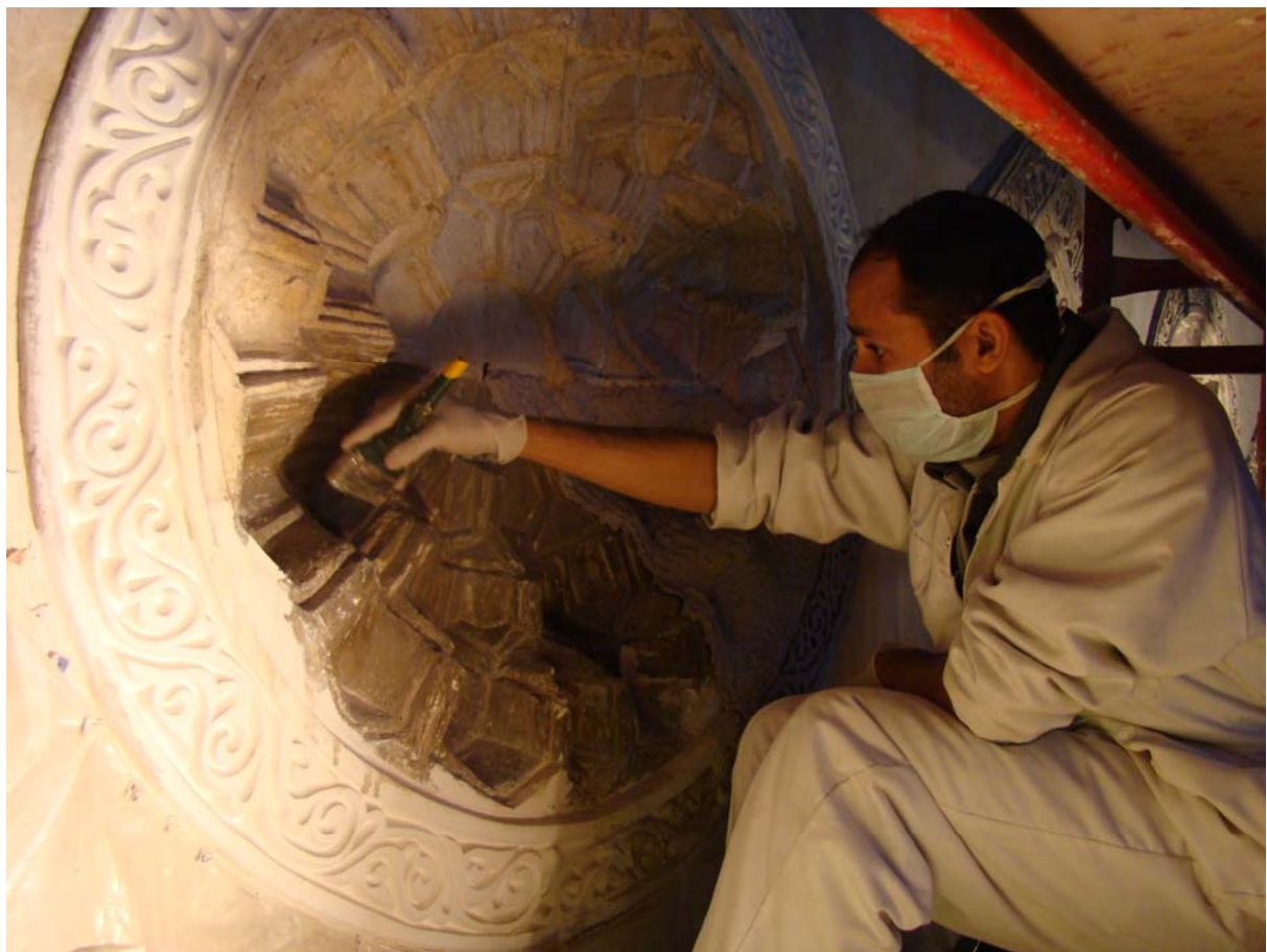
The roundel after completion and during cleaning