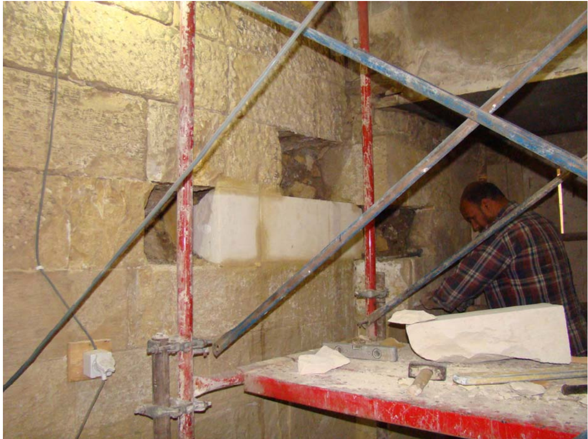
Stone replacement activities in the lower part of the dome