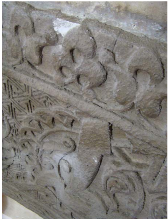
Different views of the inscription band covered with a hard crust of limewash and dust