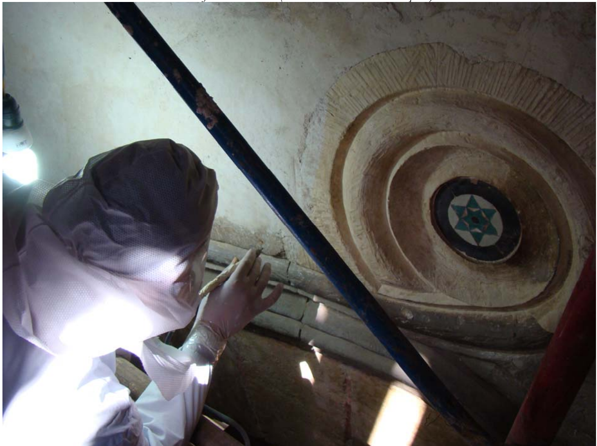
Cleaning the stone arch on the west façade of the courtyard using the micro-sand-blaster