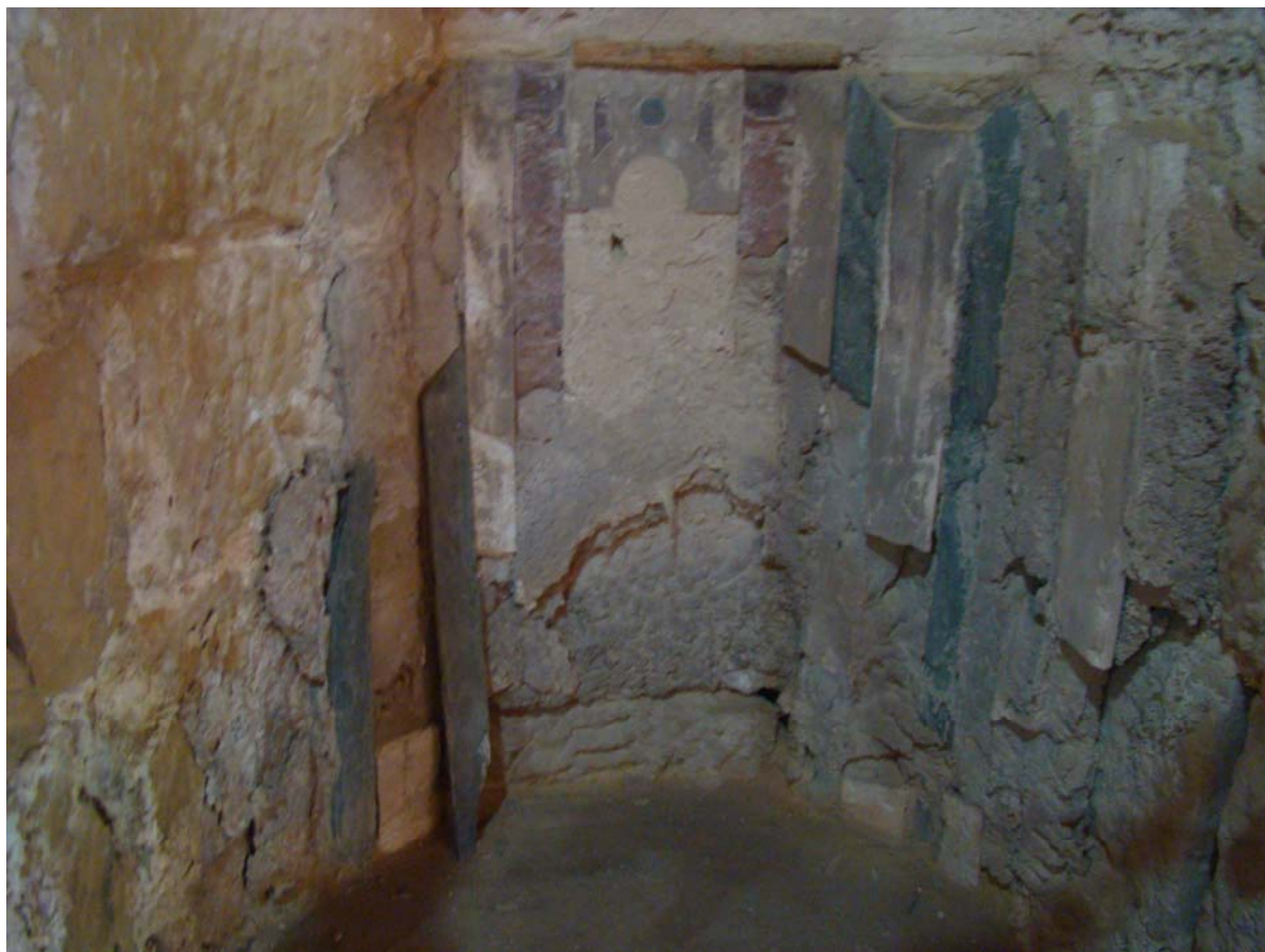
The condition of the marble of the mihrab