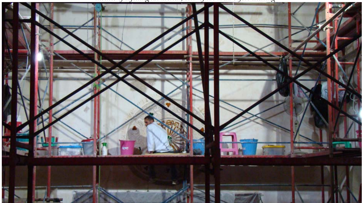
View of the qibla iwan after cleaning the upper part of the main façade of the qibla iwan