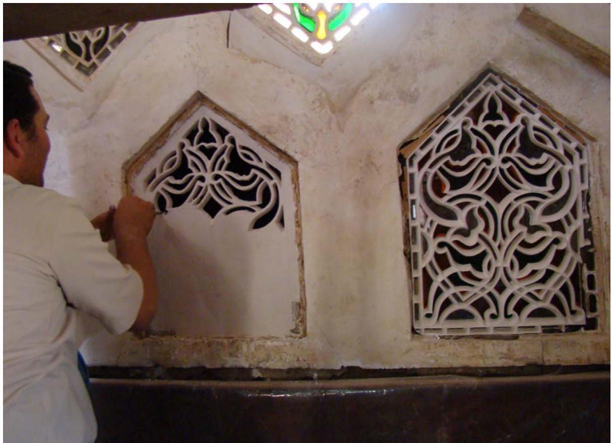
Completing the stucco windows and carving them in-situ where old stucco was remaining (right one complete)