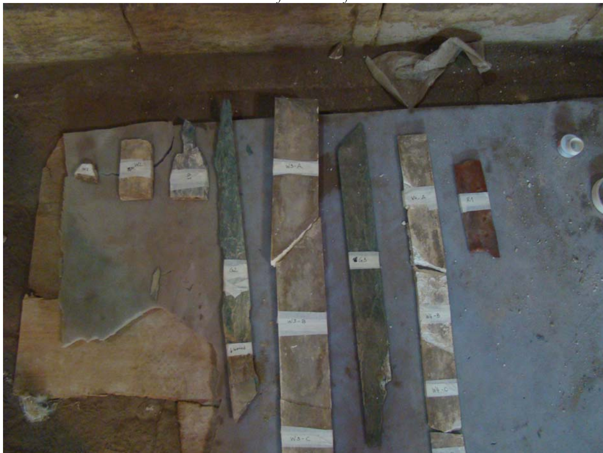
The numbering of the dismantled marble