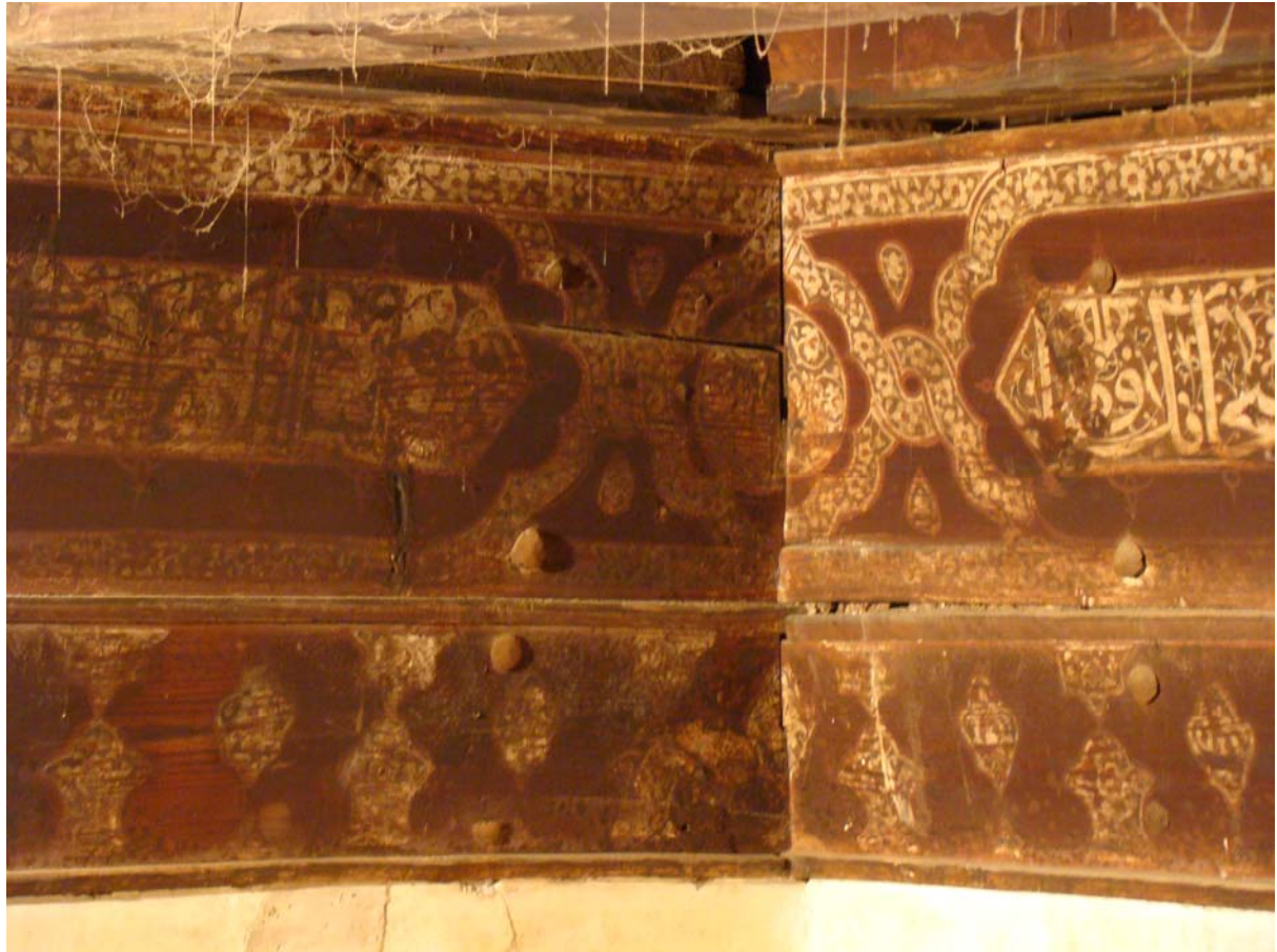
Detail of the ceiling of the West Iwan to be conserved in the period from April – June 2008

Finalize stone replacement activities in the lower part of the dome.