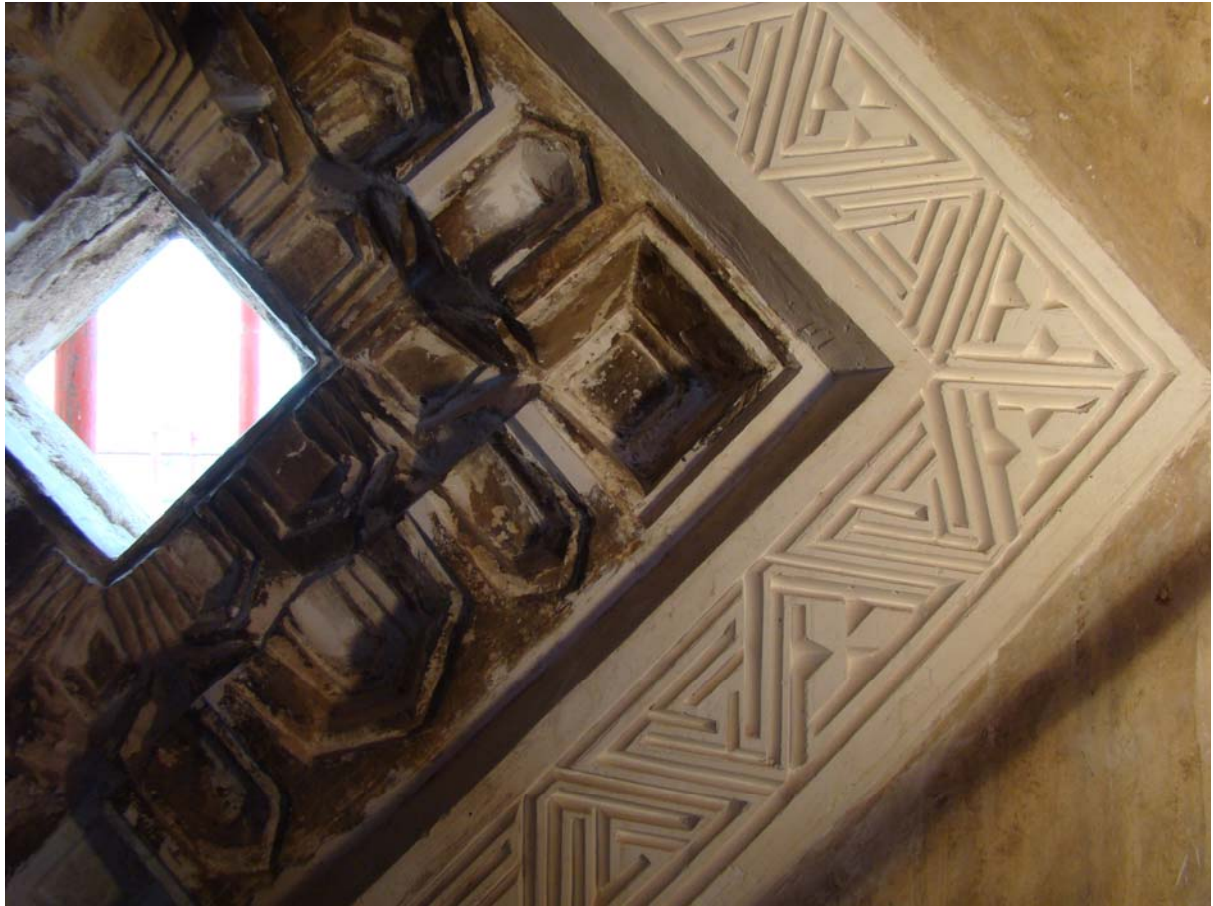
Stucco decoration reconstruction