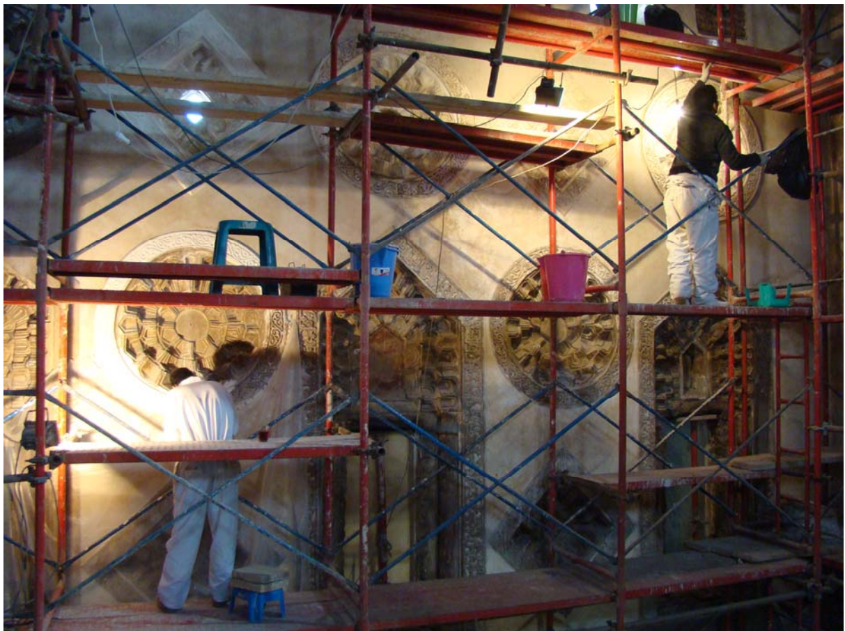
General overview of the north façade of the courtyard during cleaning