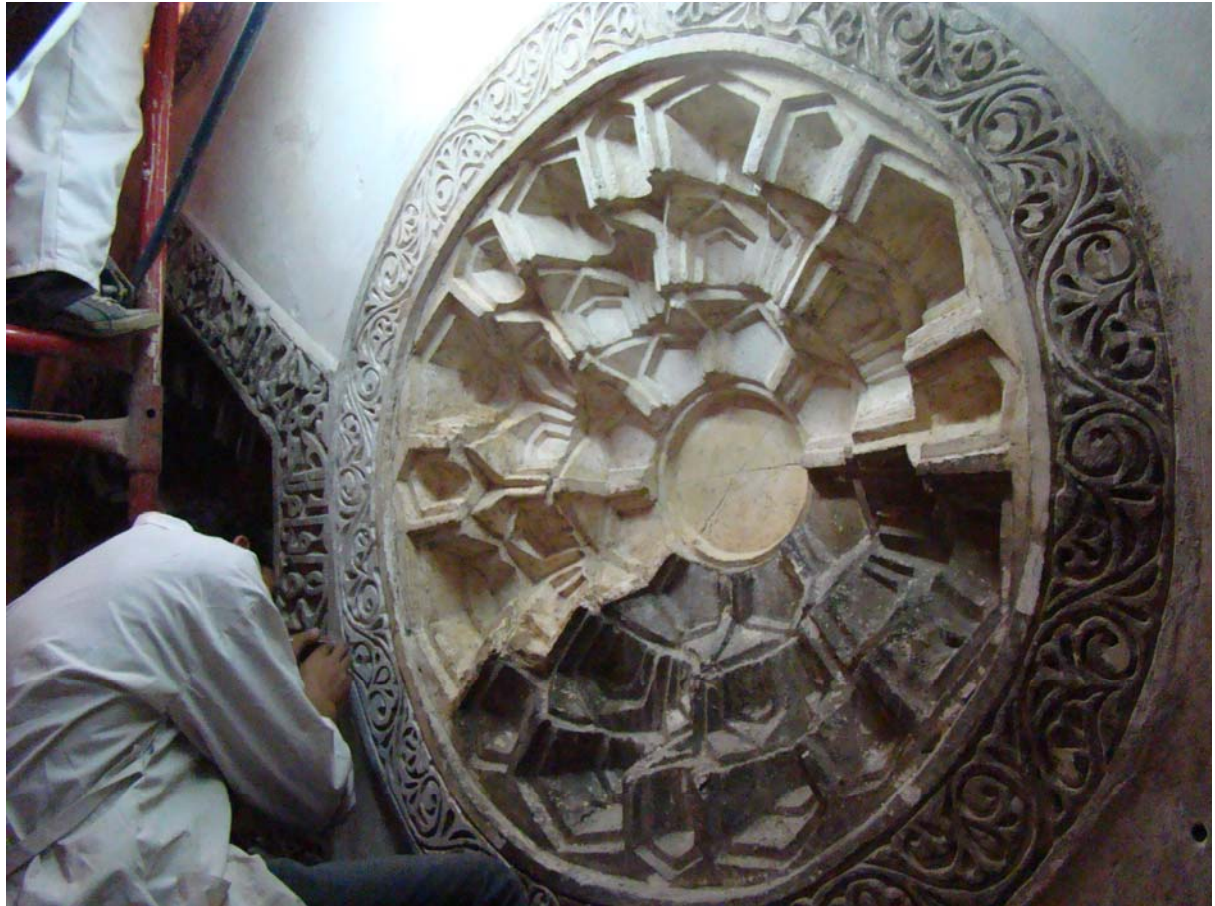
Activities of cleaning the gypsum decoration