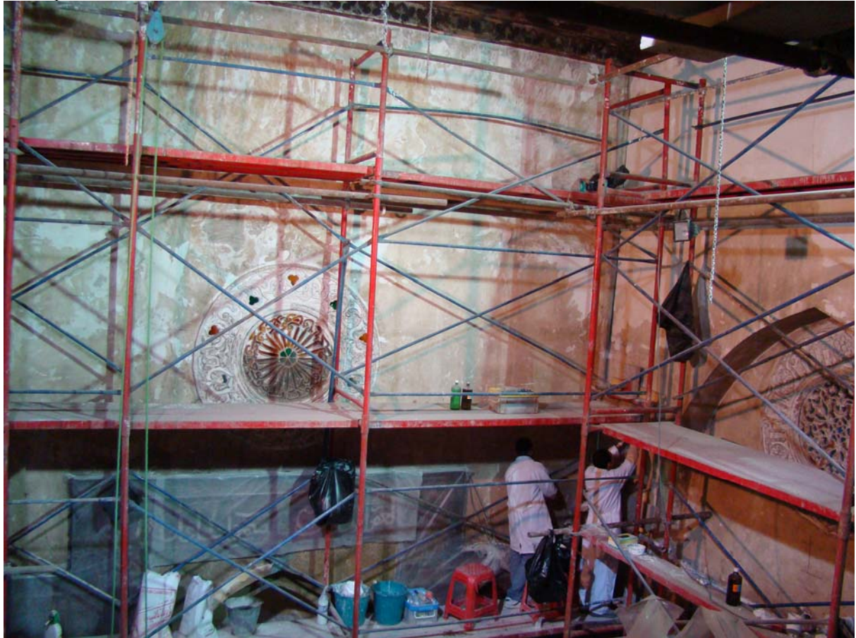
Activities of injecting the mortar; view of the iwan before cleaning

The activities in the 3 iwans started by similar treatment of the plaster like for the plaster of the courtyard in terms of injection, plaster cleaning using poulticing, cleaning of stucco decoration and filling the cracks in the plaster.