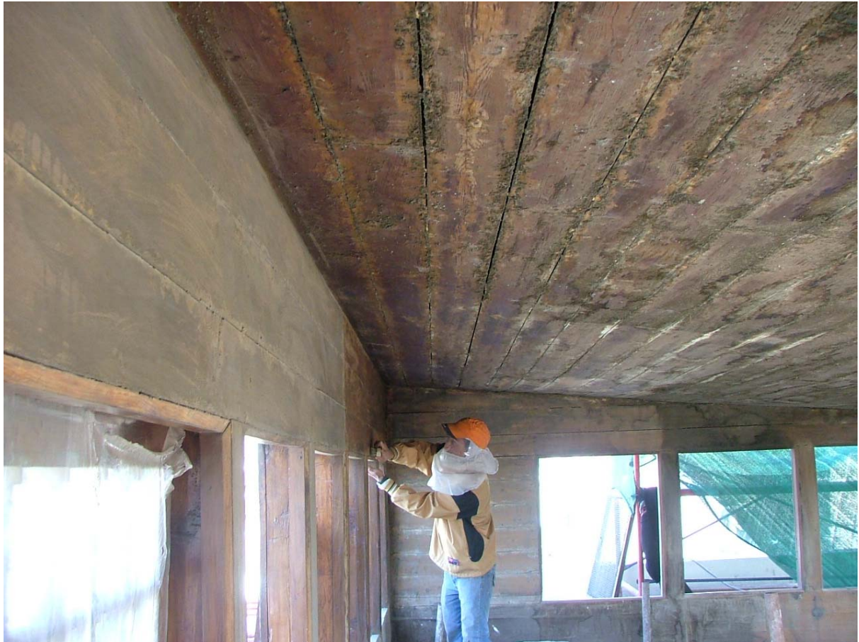
Activities of cleaning the dust from the interior of the shokhsbaykha