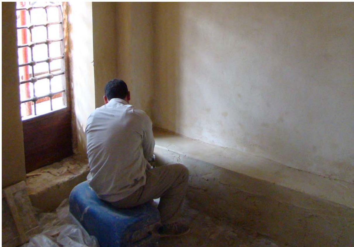
Plastering activities in the rooms