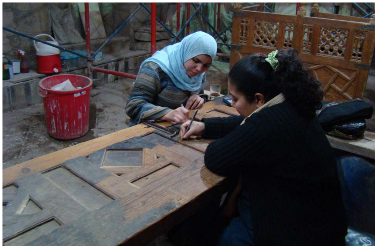
Cleaning activities of the wooden door of the entrance of the mausoleum (D2)

As mentioned in the previous report, the woodwork restoration of doors, windows and shutters is currently in progress and will be proceeding during the following months. In general, depending on the state of conservation of the item, carpentry restoration takes place followed by fine cleaning and conservation of the wooden elements.