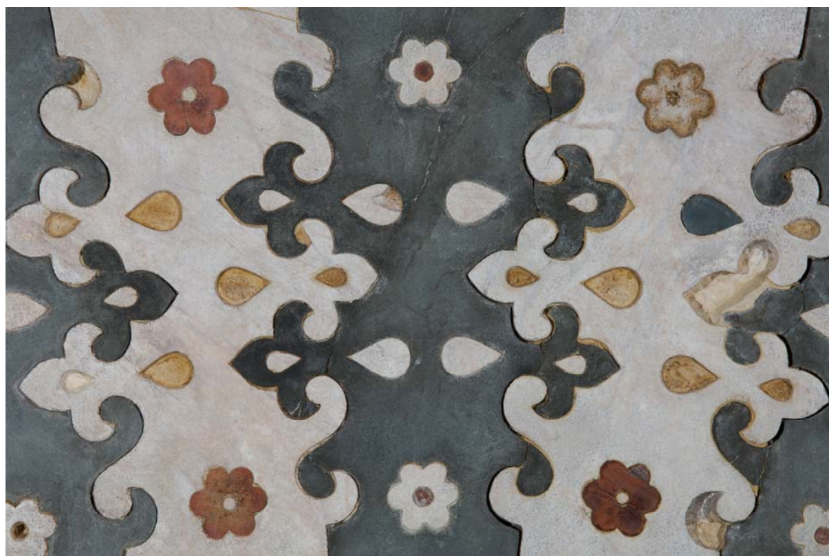
Detail of the marble decoration of the west façade – after cleaning

The documentation activities of the intervention drawings are in progress.