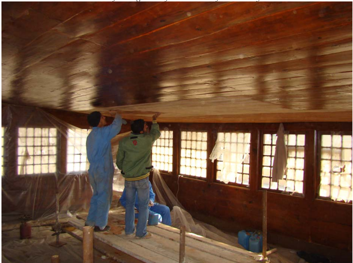
Painting the shokhsbaykha