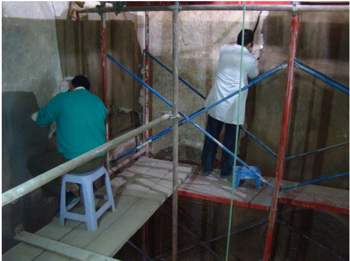
Removal of limewash in the middle part of the dome