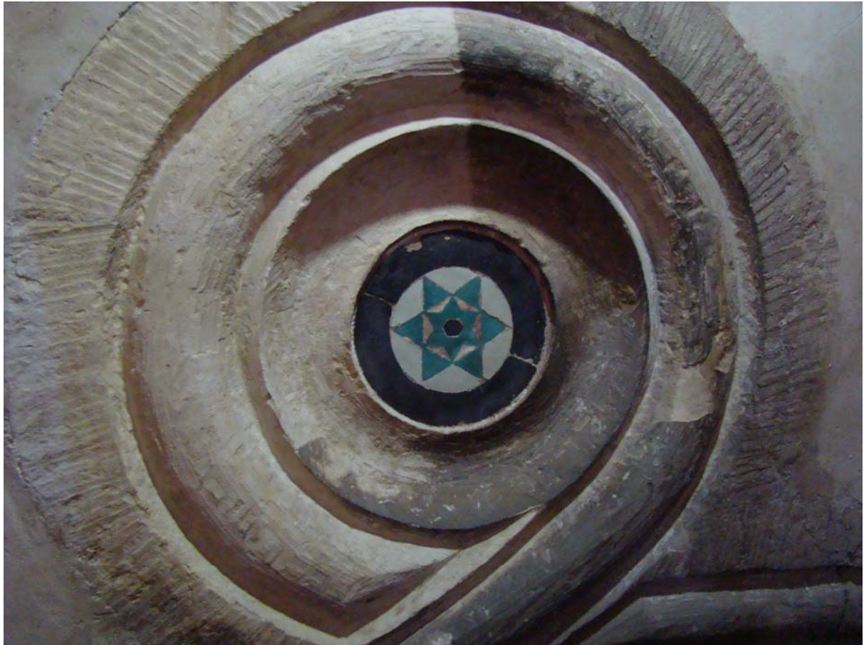
Detail of the stone arch (cleaned versus non-cleaned part)