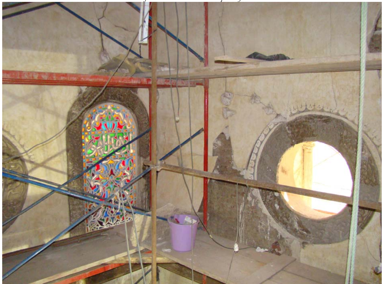
The middle part of the dome after the cleaning of the plaster surfaces: The cracks will be treated in April-May, as well as the cleaning of the stucco carved decoration around the windows.