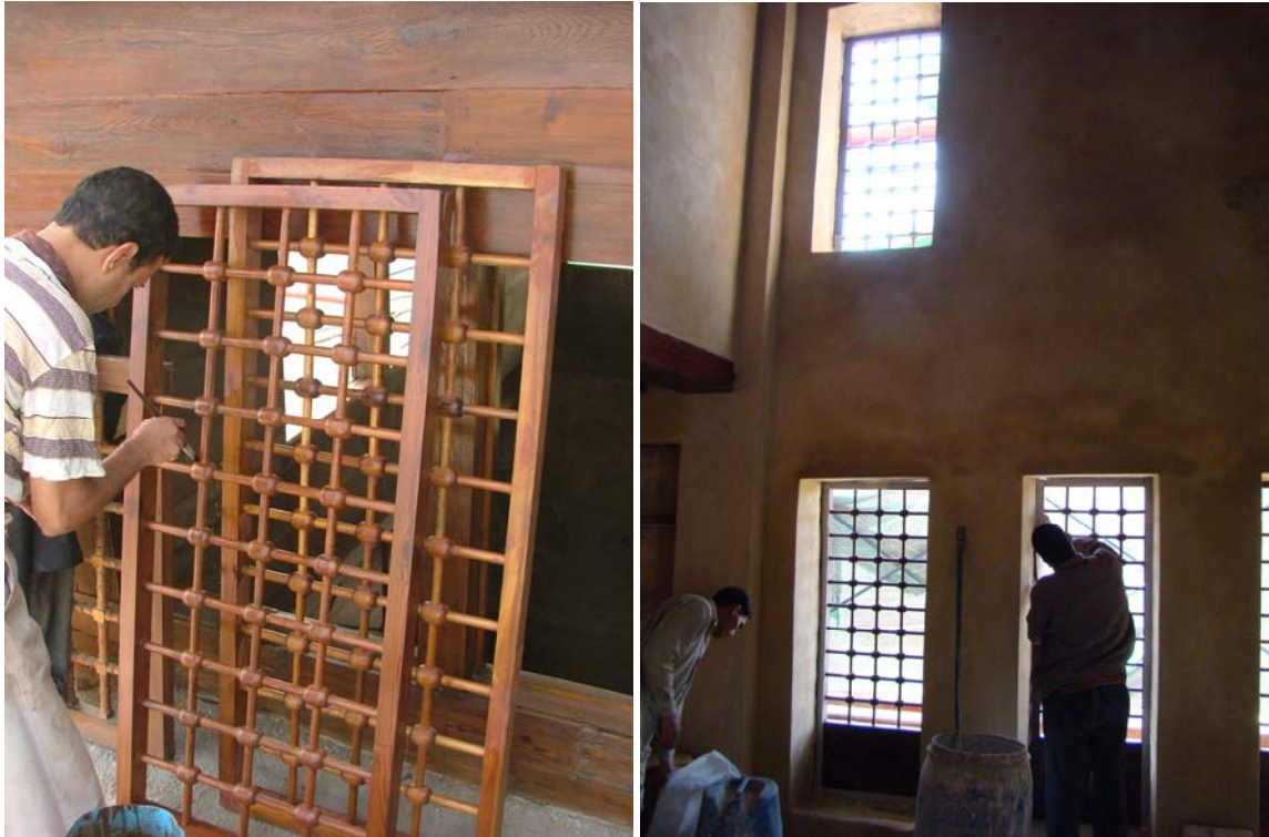
Painting the wooden grills and installing them in the rooms