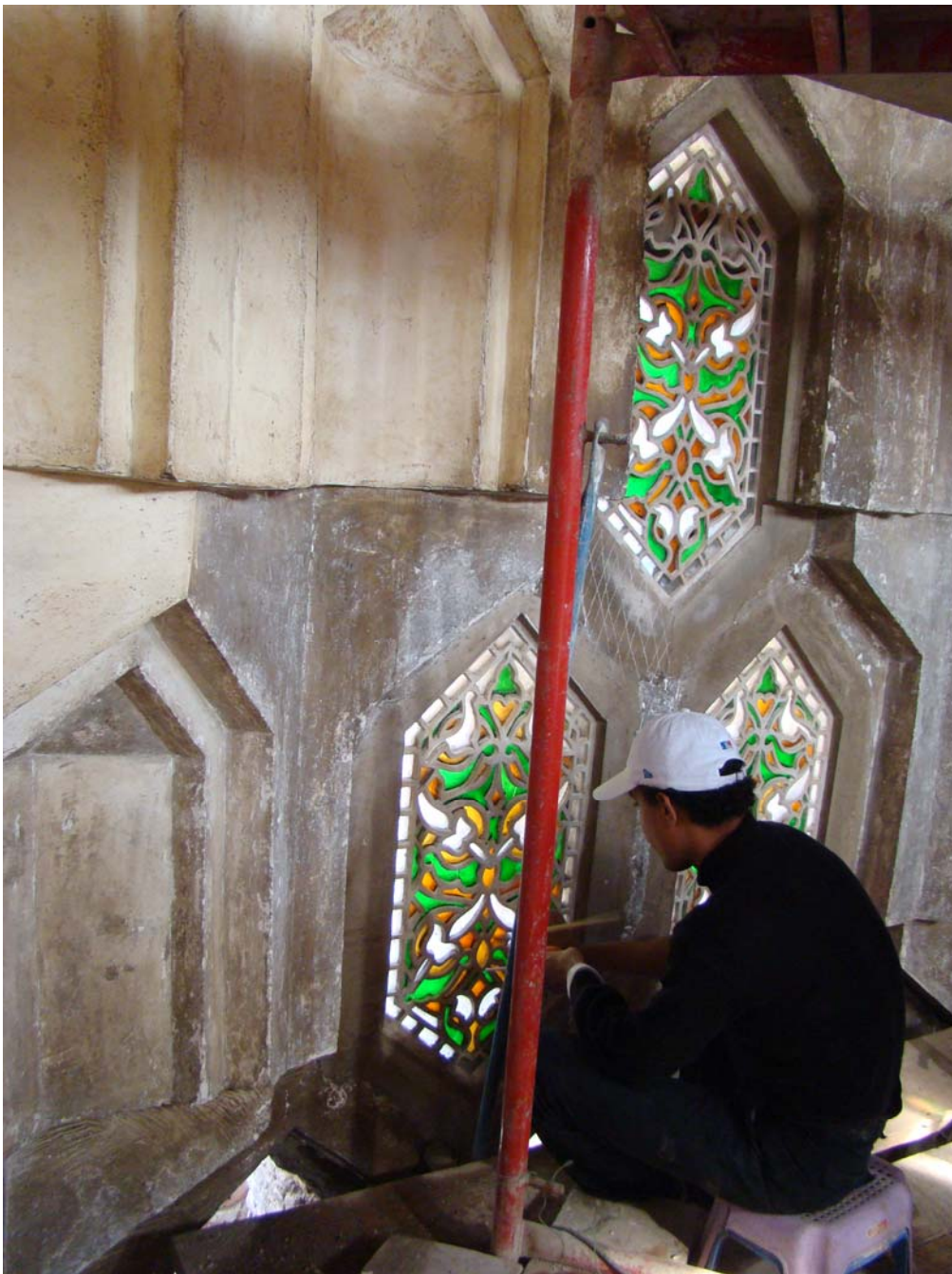
View of the dome during the cleaning of the plaster and the stucco grills – also showing a part of the plaster not cleaned

In the mihrab area, it was necessary to remove the remaining marble decoration as they were totally detached from the background. The stones behind were in a bad condition and full of salts. The marble slabs were documented and will be returned in situ after the restoration. Also one marble column was leaning and not well fixed in place; it was temporarily removed.