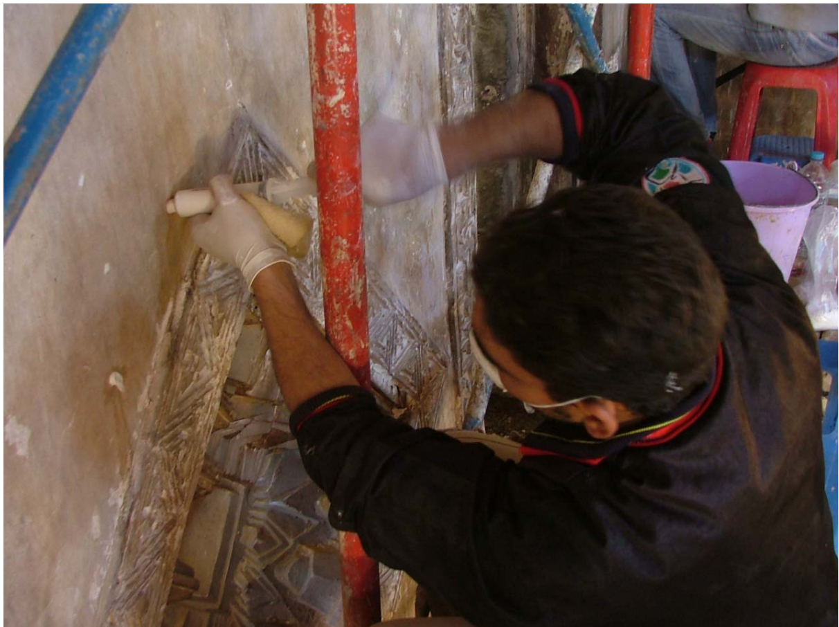
Injection activities of the plaster

After cleaning the wood of the shokhsbaykha covering the central courtyard, it was painted; the work is completed.