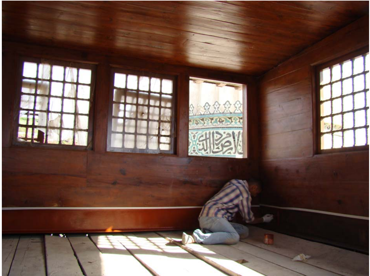
Painting the steel beams carrying the wooden shokhsbaykha