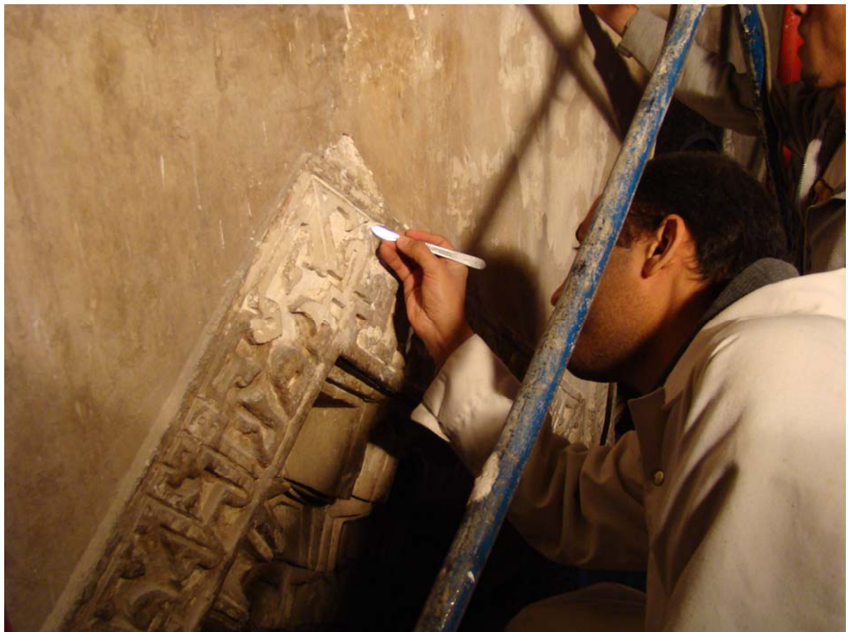
Mechanical cleaning of the limewash layer on the stucco decoration