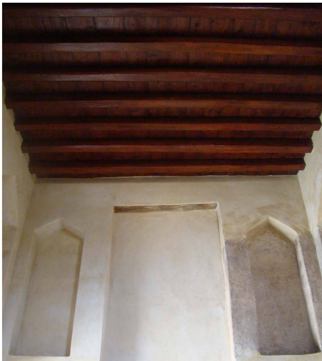
Room 1.3 after finalizing the painting of the ceiling