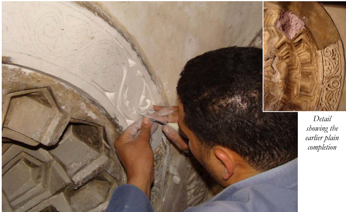
Detail showing the earlier plain completion