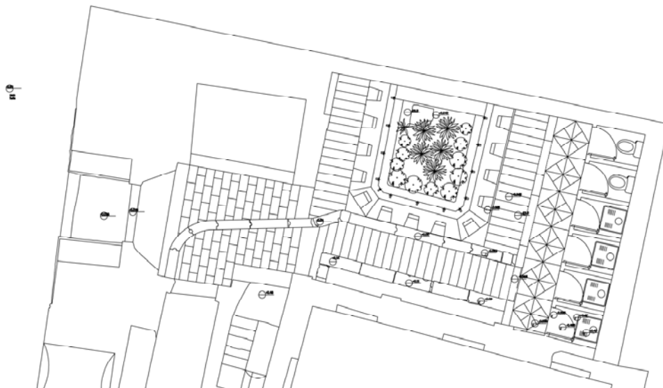
The design of the ablution showing the archaeological remains in view