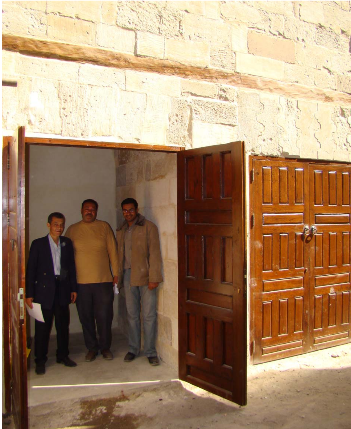
Two of the shops on the western façade after their restoration – representatives from the SCA with one of the owners

The restoration of the shops on the western façade were finalized, their wooden doors completely restored and installed in place. The shops were returned to their owners through the Supreme Council of Antiquities.