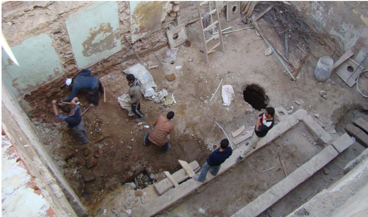
The space of the ablution area after the demolition of the old one; the archaeological remains in view

Start the construction activities of the ablution area and finalize the foundations, the sanitary works, the brick and stone works and the wooden ceilings. Finishes are planned for the third quarter of the year.