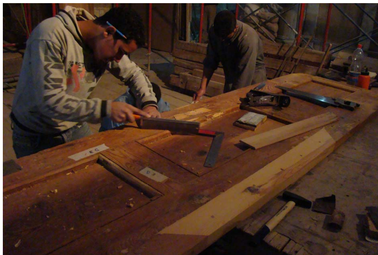
Architectural repair of damaged parts in the wooden shutters (D3)