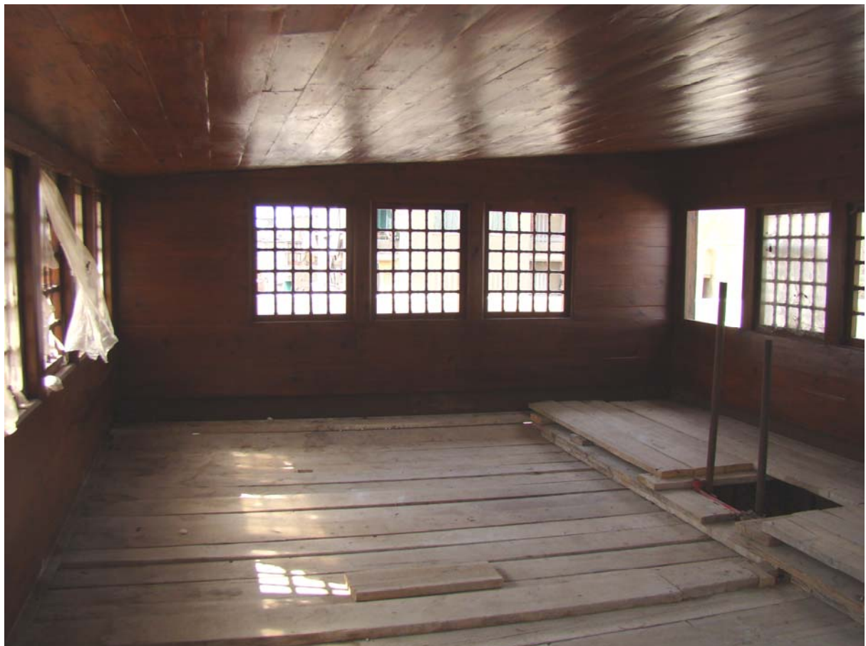
The shokhsbaykha after cleaning and painting